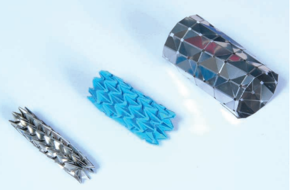
Insider. Creased stent is designed to snap open inside an artery.

At first glance, You's lab appears messy, littered with crumpled paper, grocery bags, and cans. But on closer inspection, the folded sheets are prototypes of foldable building